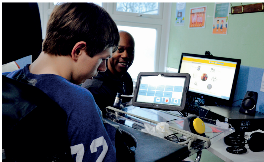
A Charlton Park Academy CENMAC student collaborating with a first year UEL Social Work student on the Multimedia Self-Advocacy Unit. March 2017

Welcome to our new half termly newsletter which we hope will continue to give you lots of practical information around assistive technology and SEN provision and keep you up to date with developments and news. Watch out for our prize draws. In this first edition you could win a 50% discount to upgrade all your InPrint 2 licences!